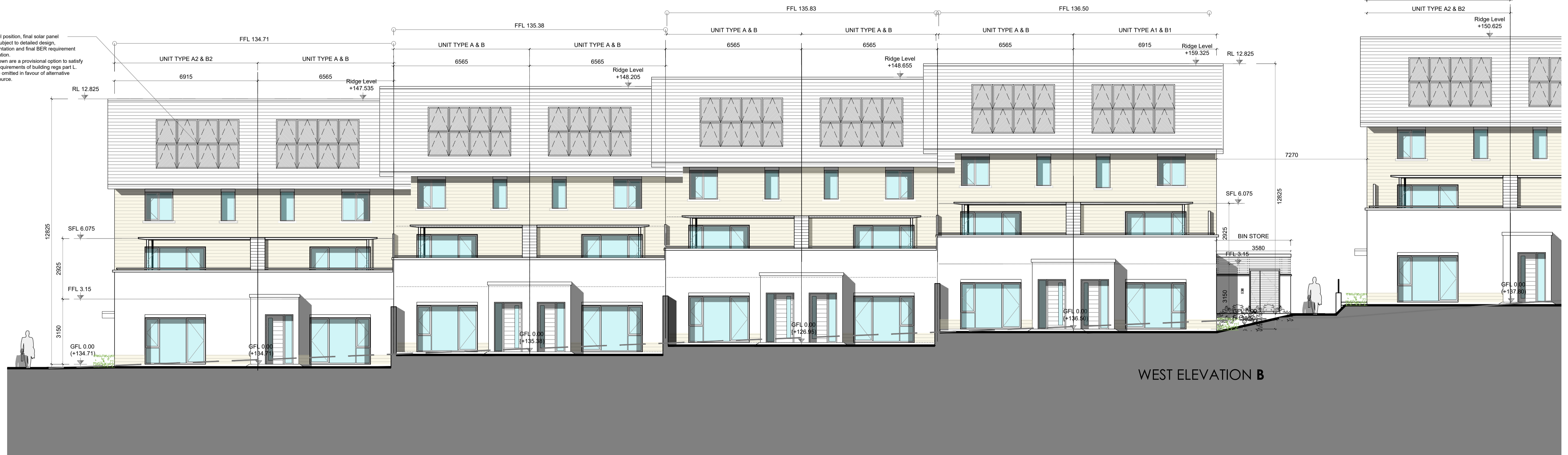
WEST ELEVATION B

Indicative solar panel position, final solar panel quantity & position subject to detailed design, on duplex block orientation and final BER requirement at the time of publication. The solar panels shown are a provisional option to satisfy renewable energy requirements of building regs part L. Solar panels may be omitted in favour of alternative renewable energy source.